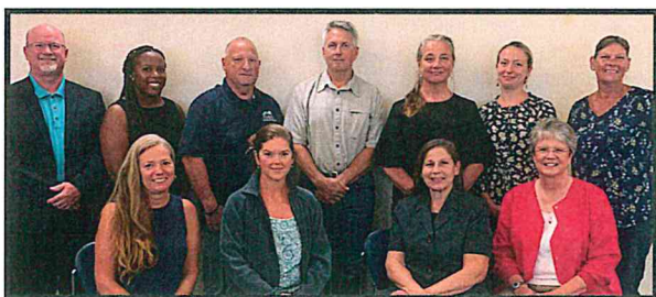
Back Row left to right: